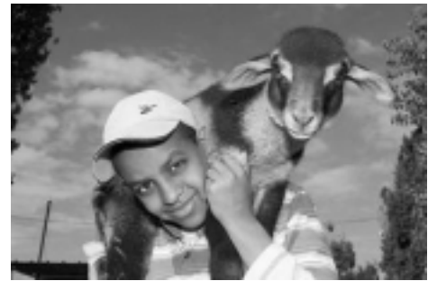
A child at Ben Yakir Youth Village playing with a goat, one of the members of the stolen herd.